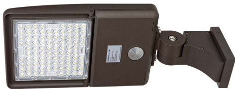
Adjustable Wall Mount