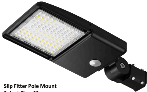
Slip Fitter Pole Mount Spigot Size: 60mm