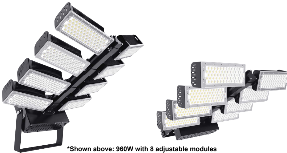
*Shown above: 960W with 8 adjustable modules